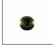
(1) Flange Nut