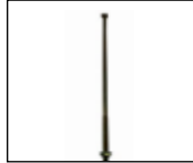
(1) Tie Rod