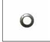
(1) Lock Washer