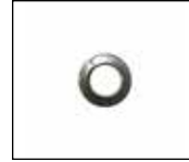
(1) Lock Washer