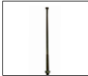
(1) Tie Rod