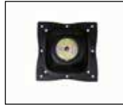
(1) Top Plate