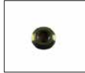
(1) Flange Nut