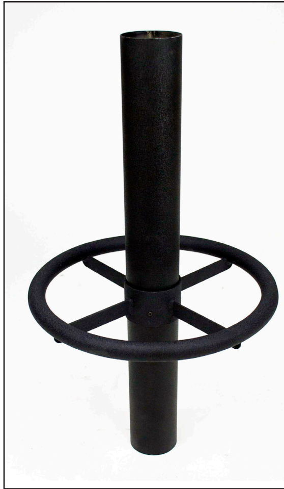
Constructed Wagon Wheel Footrest