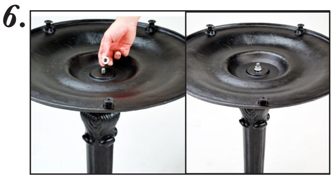
Connect base to column by tightening nut. Flip over for finished product