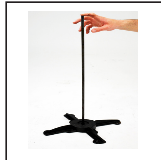
Flip spider and rod upside down, threaded end of rod should face up.