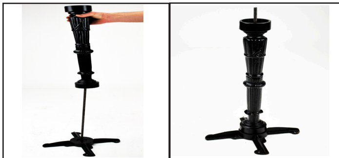
Place column over rod