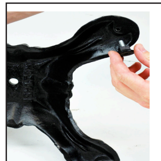
Screw glides into bottom of base.