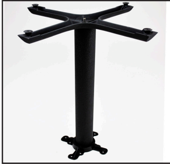
Step 4 Continued