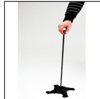
Flip spider and rod upside down, threaded end of rod should face up.