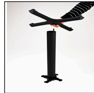
Flip base upside down and guide rod through base's center hole