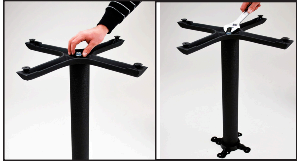
Connect base to column by tightening nut. Flip over for finished product